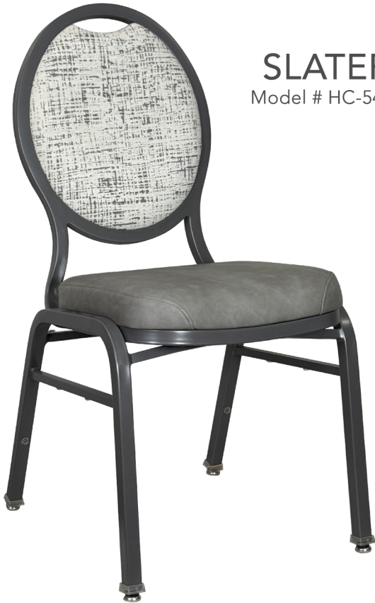
SLATER Model # HC-5445