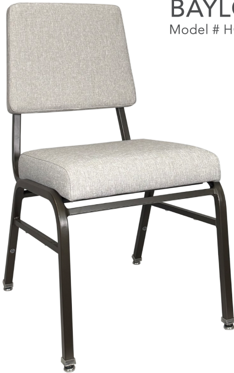
BAYLOR Model # HC-271