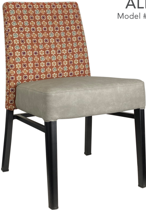
ALICE Model # HC-119