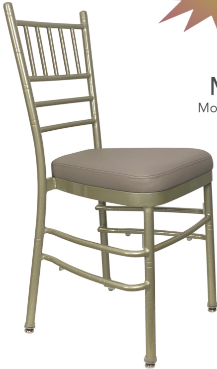
MILAN Model # HC-74-S