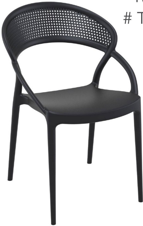
Twilight # TWI-088