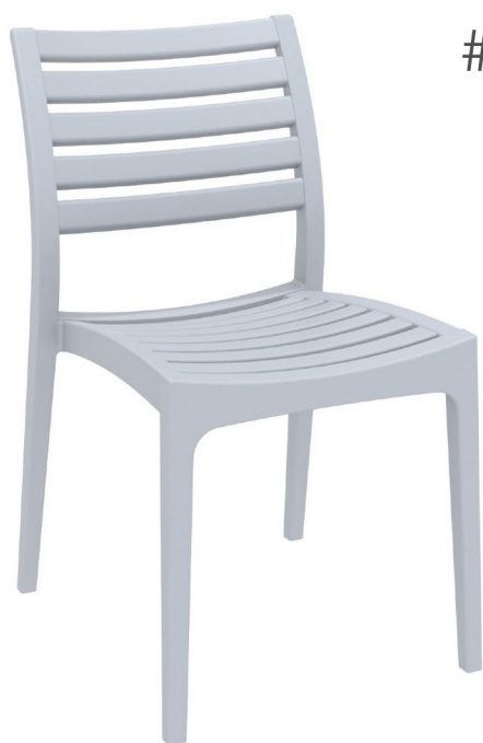
Rung-Back # RNG-009