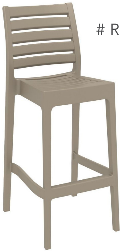
Rung-Back # RNG-009-BS-30