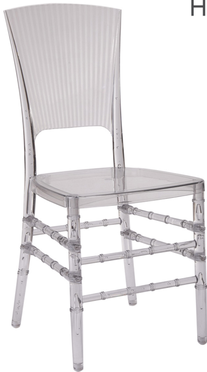
HAMPTON Model # SH006