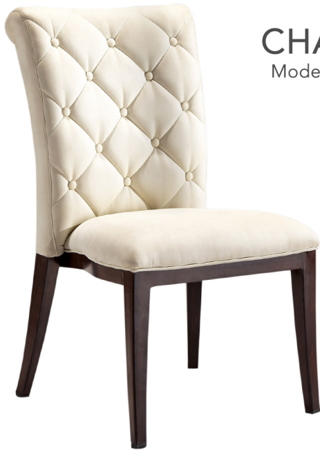
CHARLES Model # HC-171