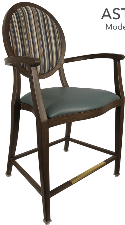
ASTORIA Model # BS-930