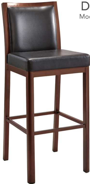
DEXTER Model # BS-1565