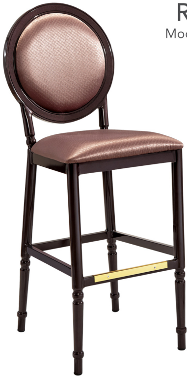
Ronald Model # BS-1561