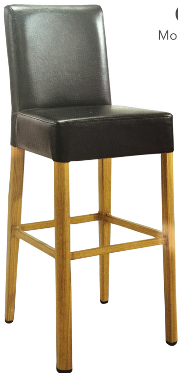
CLIVE Model # BS-1549