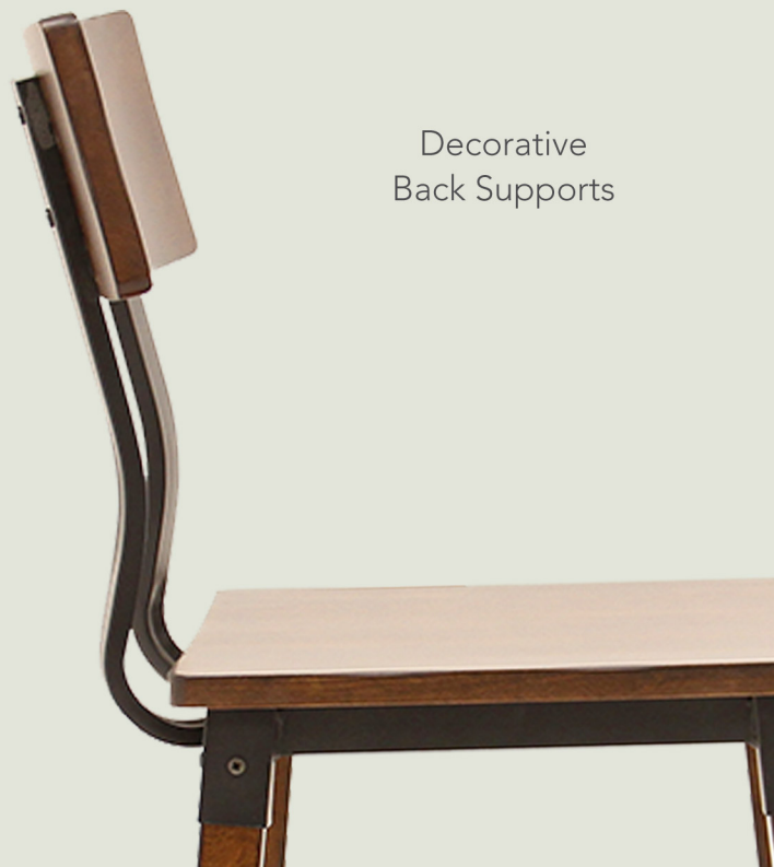
Decorative Back Supports