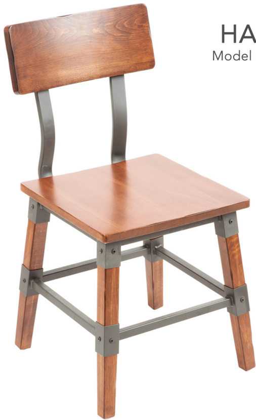
HAZE Model # 8523