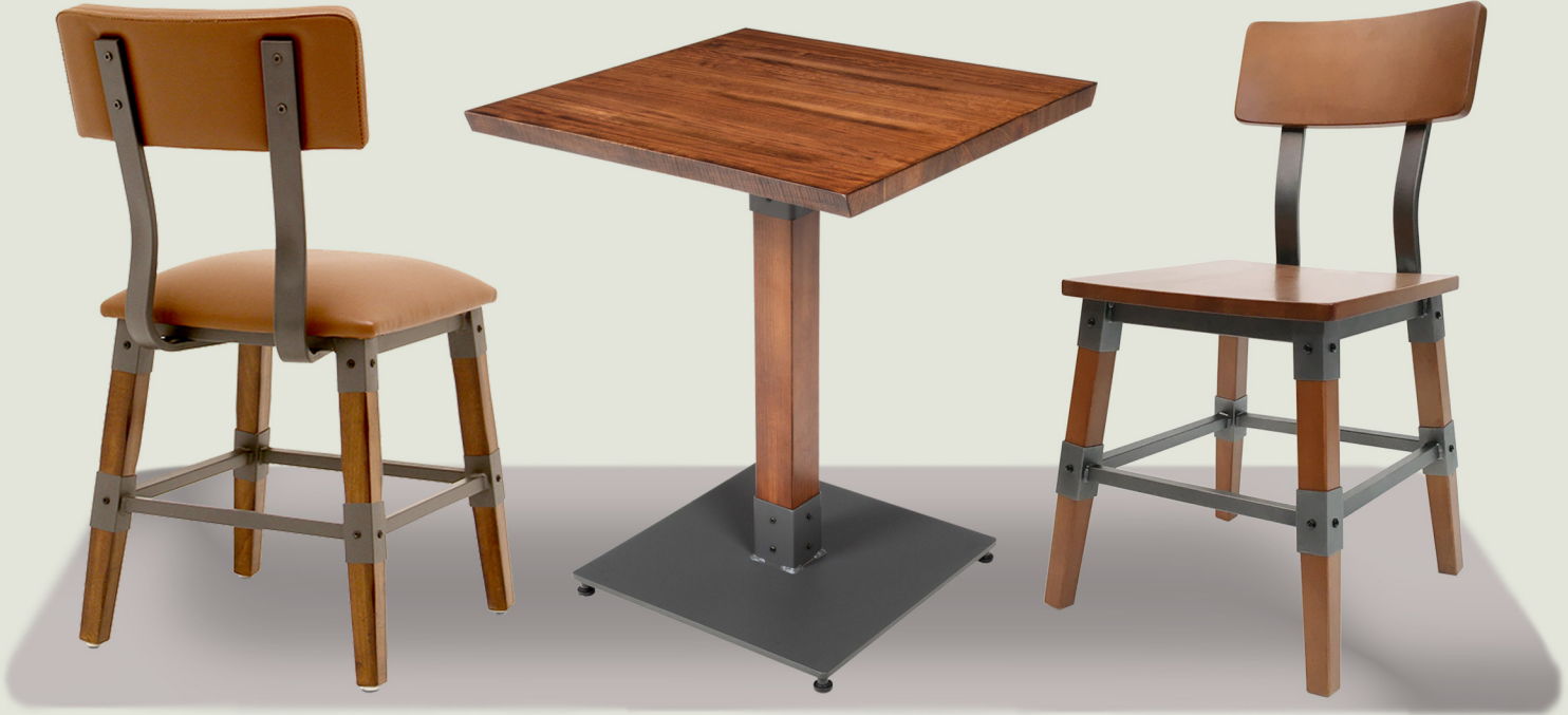
Padded Seat Padded Back