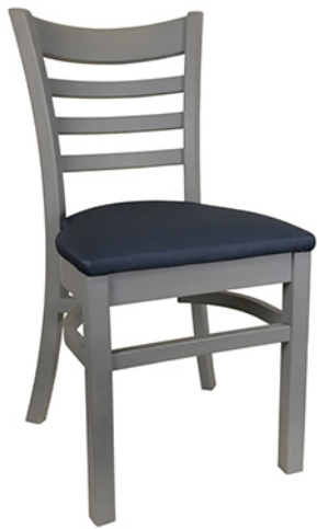
GRAY (Shown w/ optional padded seat)